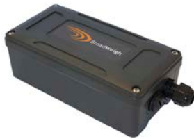
BW-AR Active repeater to extend wireless range or coverage