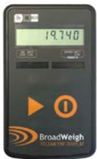
BW-HR Handheld Wireless Display LCD reading from an unlimited number of BroadWeigh shackles