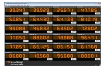
BW-LOG100 Free data logging software package for advanced monitoring up to 100 channels