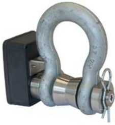
BW-S325 & BW-S475 Shackles BroadWeigh wireless Crosby Safety Bow Shackles