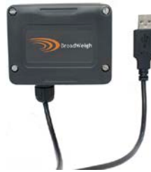
BW-BSue Extended range wireless radio telemetry USB Base Station 800m range