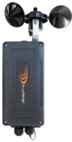
BW-WSS Wireless wind speed sensor