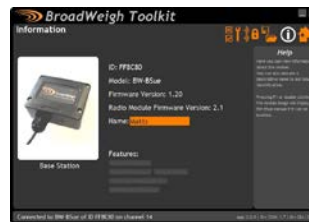
BW-Toolkit Software used to calibrate and configure your devices